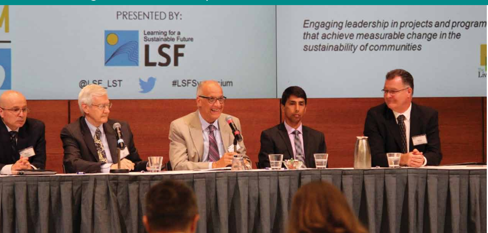
Expert Panel: Connecting the discourse on 21st century education to learning for a green economy