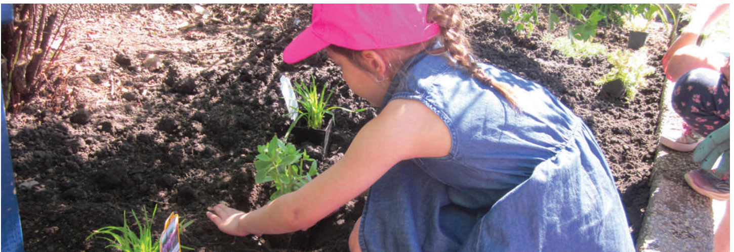
Pollinator garden Action Project at Dalhousie Elementary School in Calgary, AB

Employment and Social Development Canada Foothills School Division Grand Erie District School Board Gildan Activewear Inc. HP Canada Halton Catholic District School Board Hastings & Prince Edward District School Board Laidlaw Foundation Natural Sciences and Engineering Research Council of Canada Niagara Catholic District School Board Norton Rose Fulbright Ontario Teachers' Federation Ontario Teachers Insurance Plan Ottawa Carleton District School Board Ottawa Catholic School Board Parks Canada Pembina Pipeline Corporation Peterborough Victoria Northumberland and Clarington Catholic District School Board River East Transcona Rocky View Schools Simcoe Catholic District School Board Seven Oaks School Division Sunrise School Division Superior Greenstone District School Board Toronto District School Board Upper Grand District School Board Winnipeg School Division Whole Foods Market York Region District School Board Yukon Teachers' Association