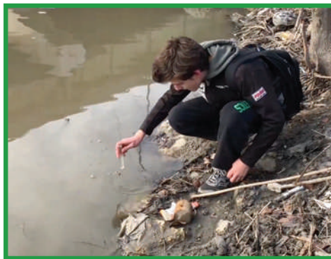
A Voice Integrative School student collecting a river water sample for their road salt Action Project

We are the Grade 8 class from Voice Integrative School in Toronto, ON. In 2018, we participated in the Water Docs @ School Action Projects program offered by LSF & EcoLogos. We began the program by identifying a water issue that we were concerned about. For our water issue, we investigated how road salt can cause detrimental effects to our local environment and the implications road salt has for human and animal health.