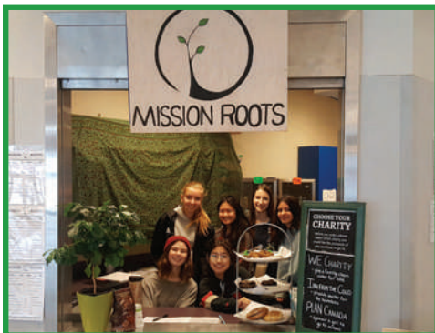
Students from Okanagan Mission High School and their "Mission Roots Cafe" sustainable enterprise

Our Sustainability class at Okanagan Mission High School in BC was frustrated with the lack of knowledge amongst our peers about global sustainability issues and the apathy most youth have towards acting to solve these issues. Together, we came up with an innovative entrepreneurial solution: Mission Roots Cafe. This in-school cafe is run and staffed by a team of 25 volunteers from grades 7-12, and it combines sustainable operations with a social enterprise structure that allows young people to make measurable change and become aware of their own power and agency. All proceeds from the cafe are donated to charities, which are selected by the students based on their transparency, traceability, and alignment with the UN Sustainable Development Goals. We also spread the word about reducing our own ecological footprints by using compostable cups and straws, composting coffee grounds and filters, and rewarding sustainable behaviours like bringing a reusable mug. In addition to raising over $3,400 for charities this year, we gained practical experience and developed a multitude of business and interpersonal skills including accounting, supply relations, marketing, employee management, customer service, cooperation, responsibility, leadership, communication, time management, and more! We were honoured to be invited to share our story at LSF's annual gala on June 14, 2018 and to receive the first place LSF-RBC Our Canada Project Award.