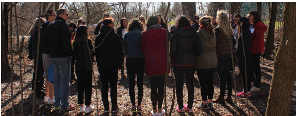
LSF Teacher Professional Development Workshop

Our mandate as educators to provide our students with opportunities to engage in actions that deepen their understanding of global issues has never been more critical. One needs only to look to the daily bombardment of alarming news cycles to confirm that we need to embrace positive change. Education has a key role to play to help young people understand the complexity of environmental challenges, and students need to feel hopeful about the future. I would like to thank LSF for all of its work to inspire teachers and students to take action and urge all of us to be environmentally responsible citizens.