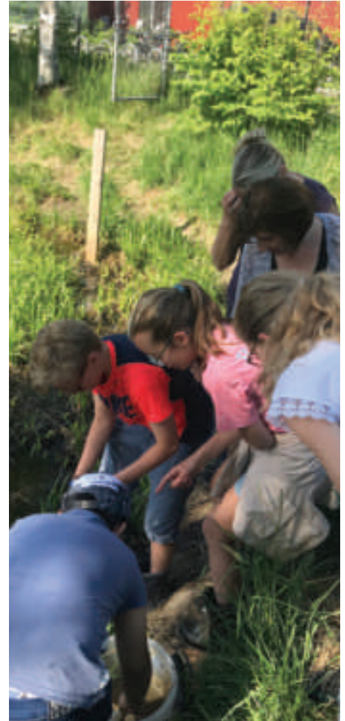
Students adopt endangered salamanders at Kjeller skole, Lillestrom, Norway

Canada and Norway have so much in common with respect to our economies, culture and education systems. Working together to share best practice serves to strengthen our Education for Sustainable Development programs in both countries!