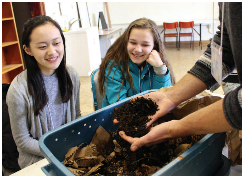
Our Canada Project Youth Leadership Forum in Fredericton, NB