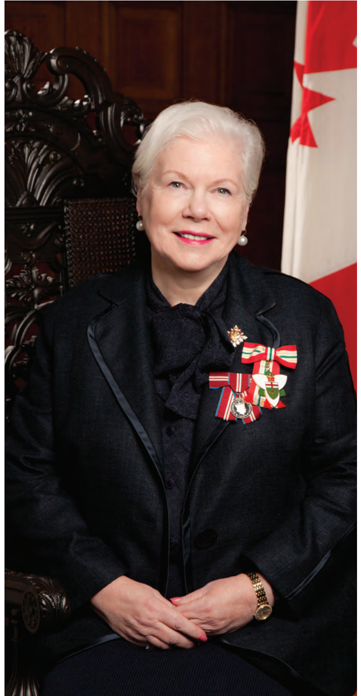
Elizabeth Dowdeswell, Lieutenant Governor of Ontario

Learning for a Sustainable Future has contributed to my sense of optimism and is a model to others for what can be accomplished by placing sustainability and resilience at the centre of education. As Honorary Patron of this esteemed organization, I offer its leaders, staff members, supporters, and volunteers my warmest congratulations on its activities during the previous year, as well as my best wishes for all that is yet to come in the months ahead.